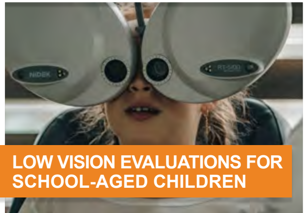
LOW VISION EVALUATIONS FOR SCHOOL-AGED CHILDREN

A low vision evaluation will help students maintain the skills and tools they need to succeed in school. CVI's optometrist and occupational therapist provide counsel and recommendations for devices and supports to fulfill the student's educational needs.